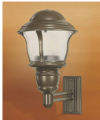
Figure 32. Permissible wall mounted Euro-style fixture.