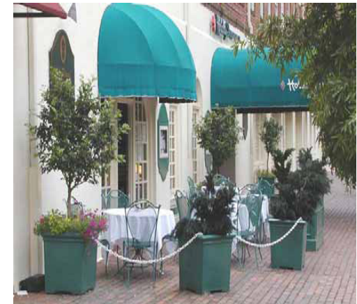
Figure 12. Acceptable planter design that utilizes attractive vases. However, the chain link used for fencing is not permitted.