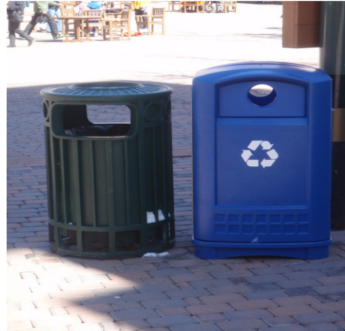
Figure 30. Non-bear proof receptacles are not permitted in Plaza Areas. In addition, the design of the recycling and trash receptables shall be consistent in design material and color.

2-203-6 Wall or tree mounted receptacles.