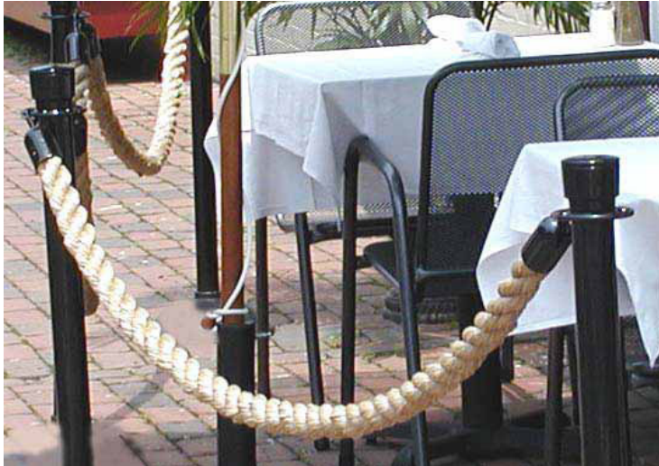
Figure 2. Acceptable rope enclosure design. The minimum diameter of rope is one (1) inch.