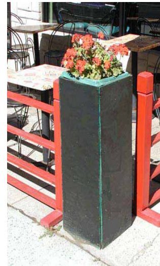
Figure 11. Planters are permitted outside the Barrier line if they are within the Barrier recommendations.