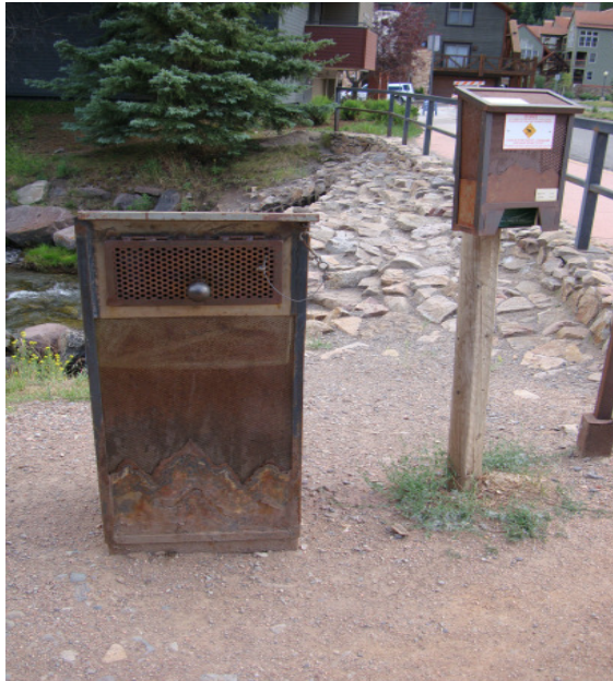
Figure 29. Bear proof receptacles shall be used in Plaza Areas.

2-203-5 One trash receptacle located within all Outdoor Dining and Seating Areas.