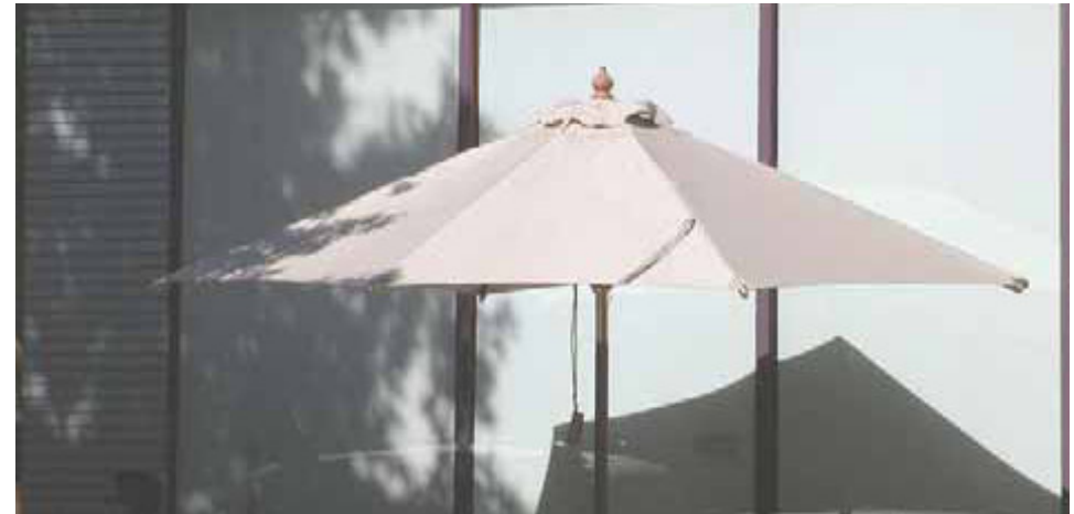
Figure 23. Example of a permissible market-style umbrella that has a canvas material and a solid natural earth tone.