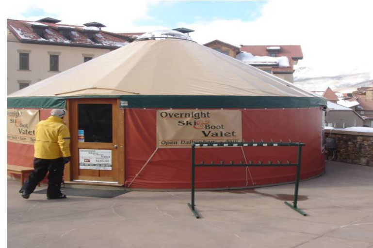
Figure 39. Tents and yurts are allowed as a Special Use.

2-207-3 Low quality materials such as plywood and PVC piping.