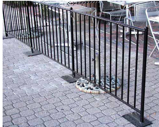
Figure 6. Acceptable wrought iron sectional fence.