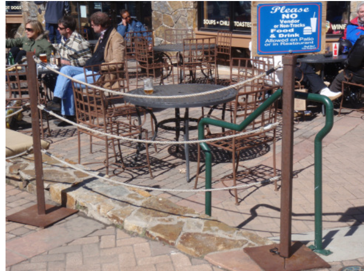
Figure 3. Barriers that are poorly constructed are prohibited.