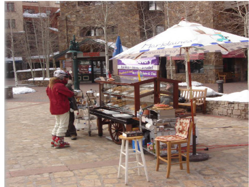
Figure 28. Vending carts that are not self-contained are not allowed.

2-202-18 Dogs attached to a Vending Cart.