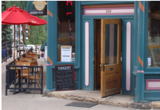
Figure 14. Signs that share a common design theme and offer a variety of information with little redundancy in content are encouraged.

Figure 13. Menu boards shall be small and of high quality design.