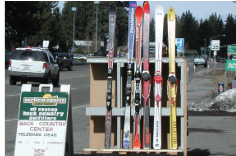
Figure 40. Ski valets shall be moveable and have an effective display such as above.