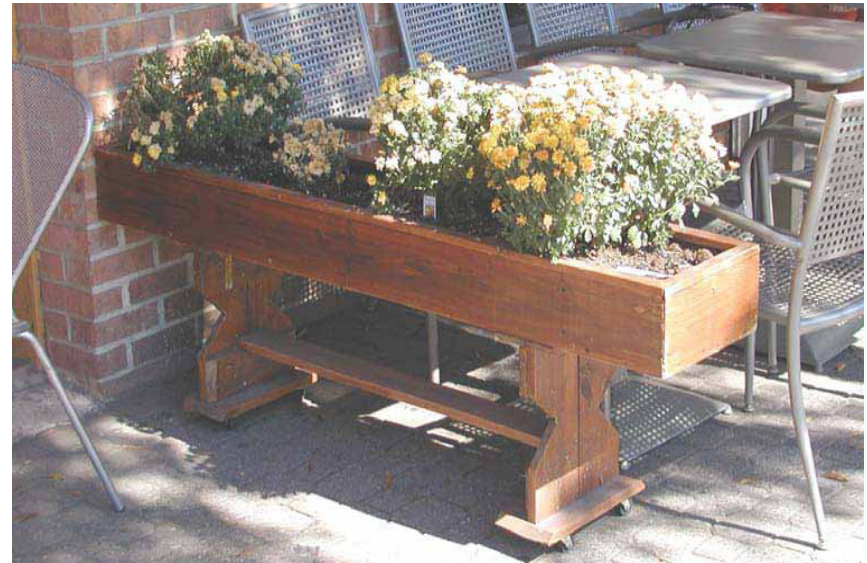
Figure 10. Where an Outdoor Dining and Seating Area is small, planters can serve as fencing.