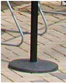
Figure 4. Acceptable base that is no more than 1/2 inch above sidewalk surface.