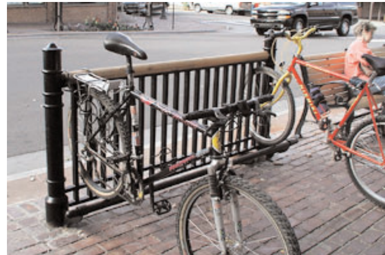
Figure 38. Example of a bicycle rack with a high quality design.