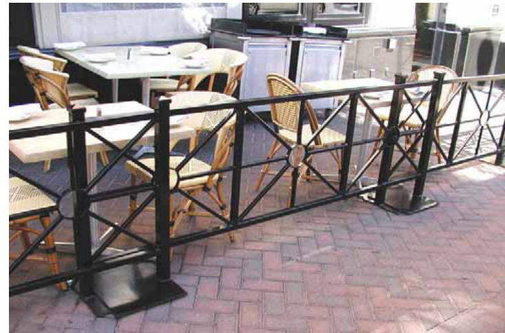
Figure 1. Acceptable fence with a decorative open design. It should be noted that per section 2-104, wicker chairs and serving stations are prohibited in Outdoor Dining and Seating Areas.

2-101-13 Barriers are not required if the food provider limits outdoor tables and chairs to one row abutting the wall of the establishment and