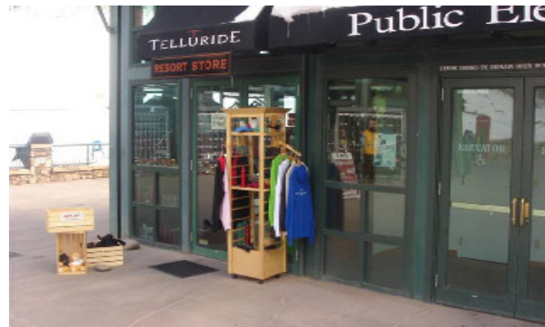
Figure 27. Well designed outdoor displays make the business more attractive to pedestrians.