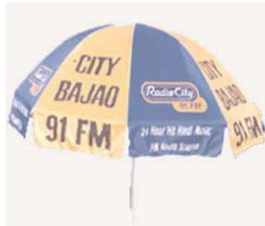
Figure 22. Example of too much advertising on umbrellas.