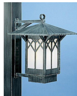
Figure 34. Permissible wall mounted prairie-style fixture with opaque glass