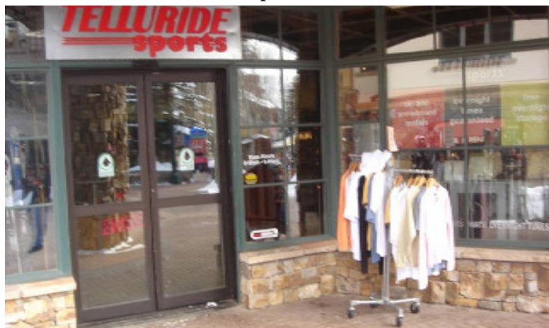
Figure 26. Clothes racks that display merchandise are encouraged.

2-201-14 Merchandise displays that are bolted into the ground or fastened to street lights, trees or other Plaza furniture.