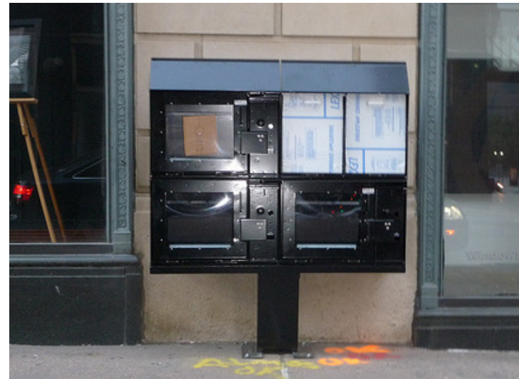
Figure 41. Media Racks shall be made of metal with clear panels and grouped together.