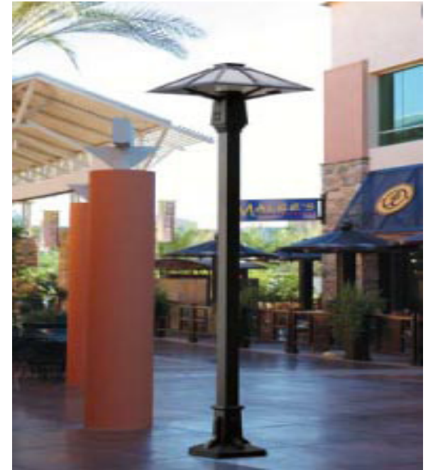
Figure 35. Permissible free-standing contemporary fixture.

2-204-9 Light spillover into adjacent businesses.