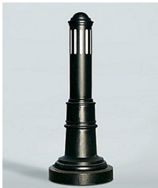
Figure 31. Acceptable bollard lighting.