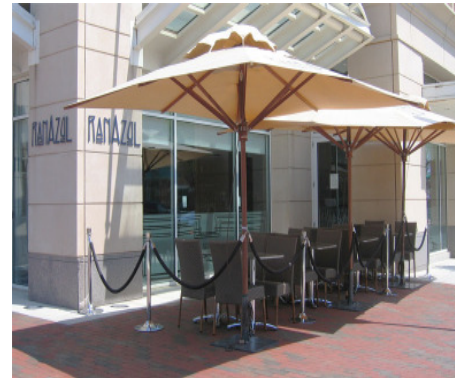
Figure 24. Example of a permissible freestanding umbrella that is not fixed to a table.