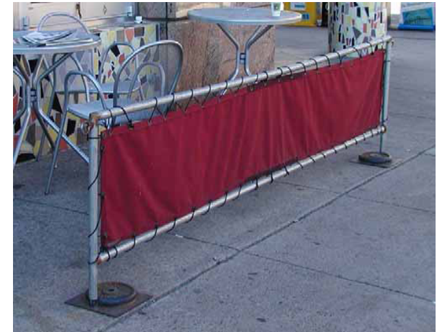
Figure 7. Fabric inserts to be used as part of a Barrier are not permitted.