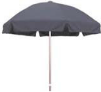
Figure 21. Example of a prohibited garden-style umbrella.