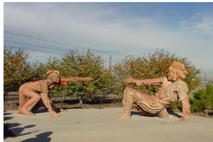
Figure 42. Public Art shall make a Plaza Area a more inviting place.

2-209-4 Functional such as benches, lighting, gates, railings and other site features.