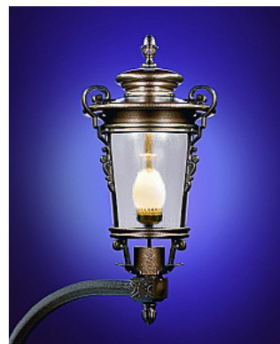
Figure 33. Wall mounted Mediterranean-style light that is permissible with opaque glass.