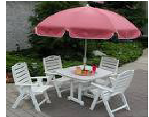
Figure 25. Example of a prohibited umbrella made of plastic and fluorescent colors.