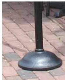
Figure 5. Acceptable domed base that is less than 4 inch in height.