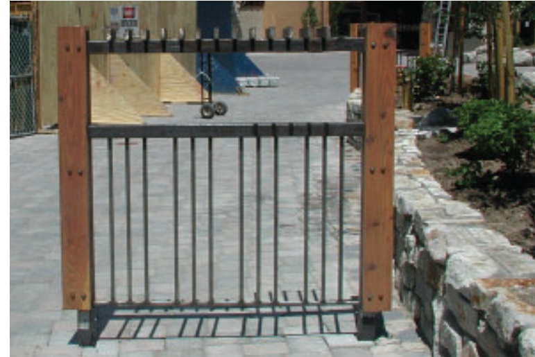
Figure 37. Example of a dual purpose ski and bicycle rack with a high quality design.

2-205-6 Low quality construction such as PVC.