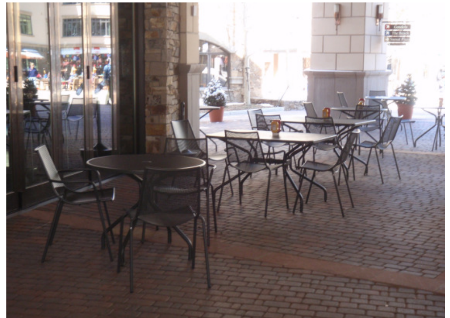
Figure 16. Tables and chairs match in color, material and design.

2-104-15 Fluorescent or other strikingly bright or vivid colors.