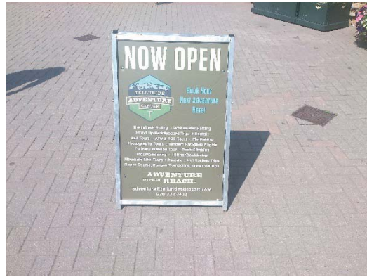
EAST SIDE ENTRANCE

Sunblock Pull-Down, See-Through Window Shading (Inside): The glass structure requires window shading to avoid glare and heat problems.