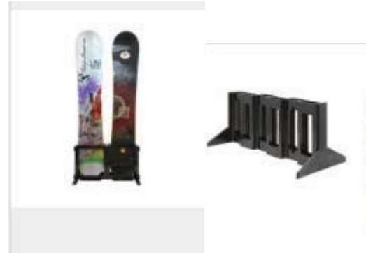
NORTH & SOUTH SIDES OF ATRIUM

Snowmobile Sled: TAC would like to periodically position a new snowmobile sled adjacent to either a front corner or a side of its shop.