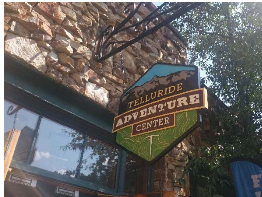
EAST SIDE ENTRANCE

TAC Logo Flags: 2 flags to be hung on flag poles above southeast and southwest corners of east + west side entrances respectively.