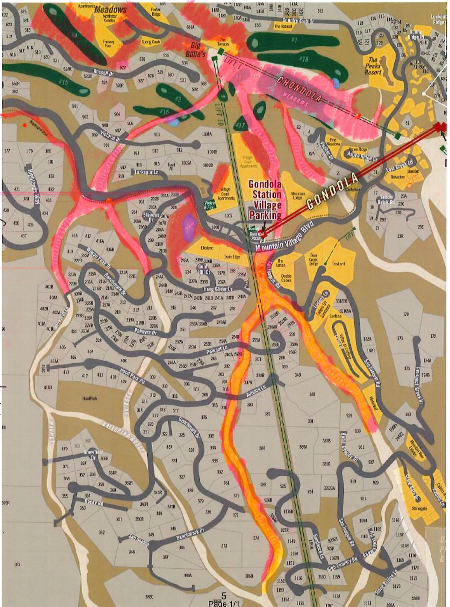
Map A. Mountain Village Overview